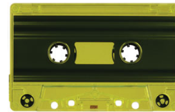
Yellow Tint MB-7422 (SONIC)