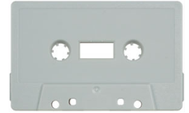
Gray Solid MB-8722 (SONIC)