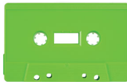
Lime Green MB-2822 (SONIC)

Recom'd Inks: White, Black, Purples, Reds, Silver, Gold