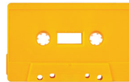
Dark Yellow MB-7722 Solid (SONIC)

Recom'd Inks: White, Black, Blues, Greens, Silver, Gold