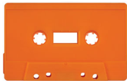
Orange MB-0722 (SONIC)

Recom'd Inks: White, Black, Brown, Reds, Silver, Gold