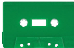
Green Solid MB-2022 (SONIC)

Recom'd Inks: White, Black, Brown, Reds, Silver, Gold