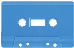
Light Blue MB-2722 (SONIC)

Recom'd Inks: White, Black, Blues, Greens, Silver, Gold