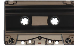
Smoky Tint MB-5422 (SONIC)