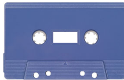
Purple Solid MB-2422 (SONIC)

Recom'd Inks: White, Black, Purples, Reds, Silver, Gold