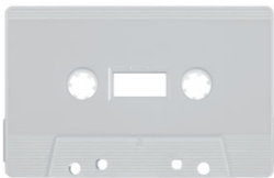
Gray Solid MB-8722 (SONIC)