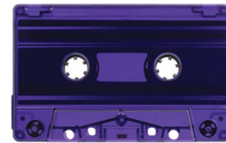
Purple Tint MB-3022 (SONIC)

Recom'd Inks: White, Black, Silver, Gold