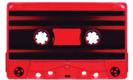
Red Tint MB-2622 (SONIC)