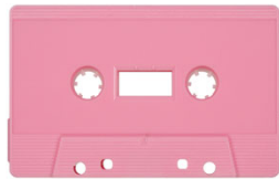
Light Pink MB-7622 (SONIC)

Recom'd Inks: White, Black, Silver, Gold