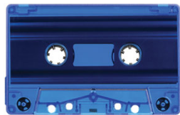
Blue Tint MB-2222 (SONIC)