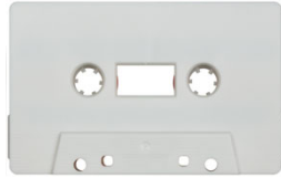
White MB-0122 (SONIC)