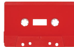
Red Solid MB-0822 (SONIC)

Recom'd Inks: White, Black, Silver, Gold