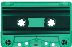
Green Tint MB-4422 (SONIC)