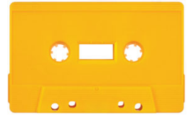
Dark Yellow Solid (SONIC) MB-7722

Recom'd Inks: White, Black, Reds, Greens, Brown, Orange, Silver, Gold