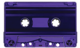
Purple Tint (SONIC) MB-3022