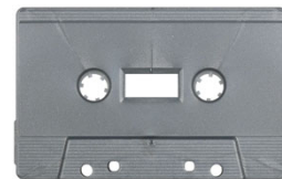
Silver Metallic (SONIC) MB-9922

Recom'd Inks: All colors except Silver and Gray