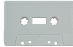
Gray Solid (SONIC) MB-8722