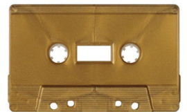
Gold Metallic (SONIC) MB-9822

Recom'd Inks: All colors except Silver and Gray