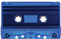
Blue Tint (SONIC) MB-2222