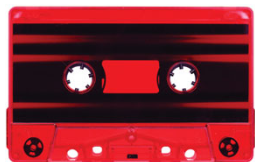
Red Tint (SONIC) MB-2622