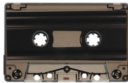
Smoky Tint (SONIC) MB-5422

Recom'd Inks: White, Black, Brown, Reds, Silver, Gold