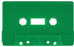
Green Solid (SONIC) MB-2022

Recom'd Inks: White, Black, Purples, Reds, Silver, Gold