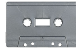
Silver Metallic (SONIC) MB-9922 Recom'd Inks: All colors except Silver and Gray

Cassette shell colors change periodically and availability is determined by supply. Refer to the Ink Color Chart to see the selection of available imprint colors.