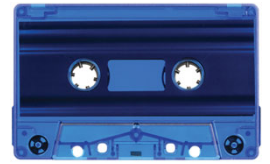
Blue Tint (SONIC) MB-2222 Recom'd Inks: White, Silver, Gold