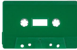
Dark Green Solid (SONIC) MB-2022D Recom'd Inks: White, Black, Silver, Gold