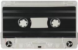
Clear w/ Black Liner (SONIC) MB-0322 Recom'd Inks: White, Silver, Gold

Contact us to for a sample if you need to be sure of the exact color of a shell. Appearance of this document may vary due to screen and printer differences, and colors of shells and small details (such as liners or leaders) may change even within a manufacturing run of shells. Availability cannot be guaranteed.