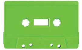
Lime Green (SONIC) MB-2822 Recom'd Inks: White, Black, Blues, Greens, Silver, Gold