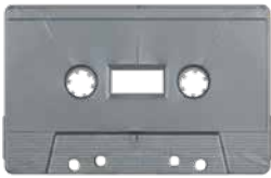
Silver Metallic MB-9922 (SONIC)

Recom'd Inks: White, Black, Silver, Gold