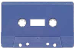
Purple Solid MB-2422 (SONIC)

Recom'd Inks: White, Black, Reds, Greens, Brown, Orange, Silver, Gold