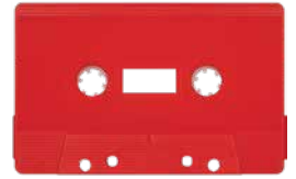
Red Solid MB-0822