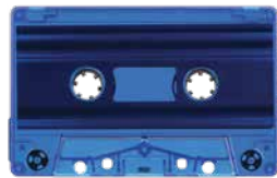
Blue Tint MB-2222 (SONIC)

Recom'd Inks: White, Black, Silver, Gold