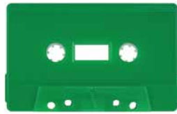
Green Solid MB-2022 (SONIC)

Recom'd Inks: All colors except Silver and Gray