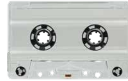
Clear w/ Clear MB-0322CL