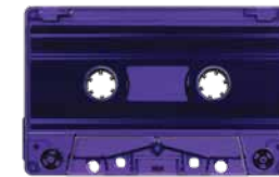
Purple Tint MB-3022 (SONIC)