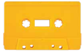
Dark Yellow MB-7722 Solid (SONIC)

Recom'd Inks: White, Black, Silver, Gold