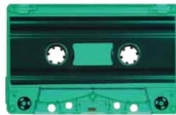
Green Tint MB-4422 (SONIC)