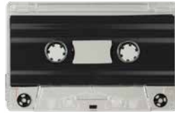
Clear w/ Black MB-0322