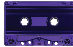
Purple Tint (SONIC) MB-3022 Recom'd Inks: White, Silver, Gold

Cassette shell colors change periodically and availability is determined by supply.