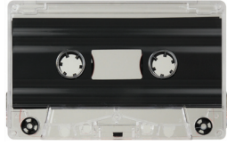
Clear w/Black Liner (SONIC) MB-0322 Recom'd Inks: White, Silver, Gold