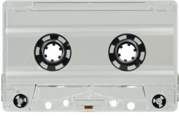
Clear w/Clear Liner (SONIC) MB-0322CL Recom'd Inks: All colors

Contact us to for a sample if you need to be sure of the exact color of a shell. Appearance of this document may vary due to screen and printer differences, and colors of shells and small details (such as liners or leaders) may change even within a manufacturing run of shells. Availability cannot be guaranteed.