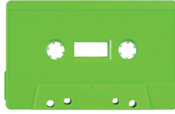
Lime Green (SONIC) MB-2822 Recom'd Inks: White, Black, Blues, Greens, Silver, Gold