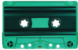
Green Tint (SONIC) MB-4422 Recom'd Inks: White, Silver, Gold